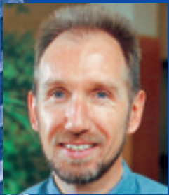
The author: Josef Hund, Fiber Systems

Spare parts availability represents a significant cost factor in the paper industry. On the one hand, immediate availability on site helps reduce downtime, but on the other hand it involves ongoing financial outlay – a balancing act which demands close teamwork between paper mill and machine supplier.