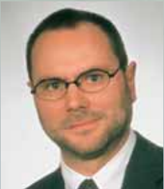
The author: Bernhard Stütze, Paper Machines Graphic

Perlen Paper Mills, located near Lucerne in central Switzerland, currently produce newsprint, improved newsprint and telephone directory paper on PM 5, and woody offset printing paper on PM 1.