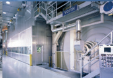
Paper Machines Board & Packaging Papers