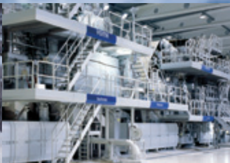
Paper Machines Graphic Papers & Specialty Papers