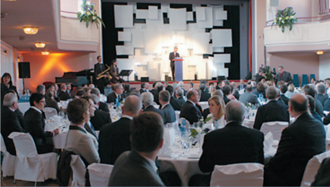
Fig. 1: View of the banquet hall at the "Konzerthaus" in Heidenheim.