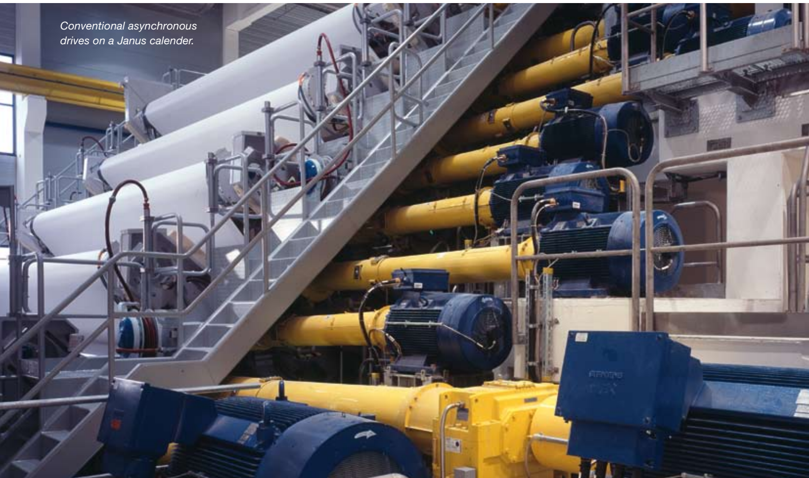
Conventional asynchronous drives on a Janus calender.

The concept does not just score highly in terms of better economy, it also offers technical benefits.