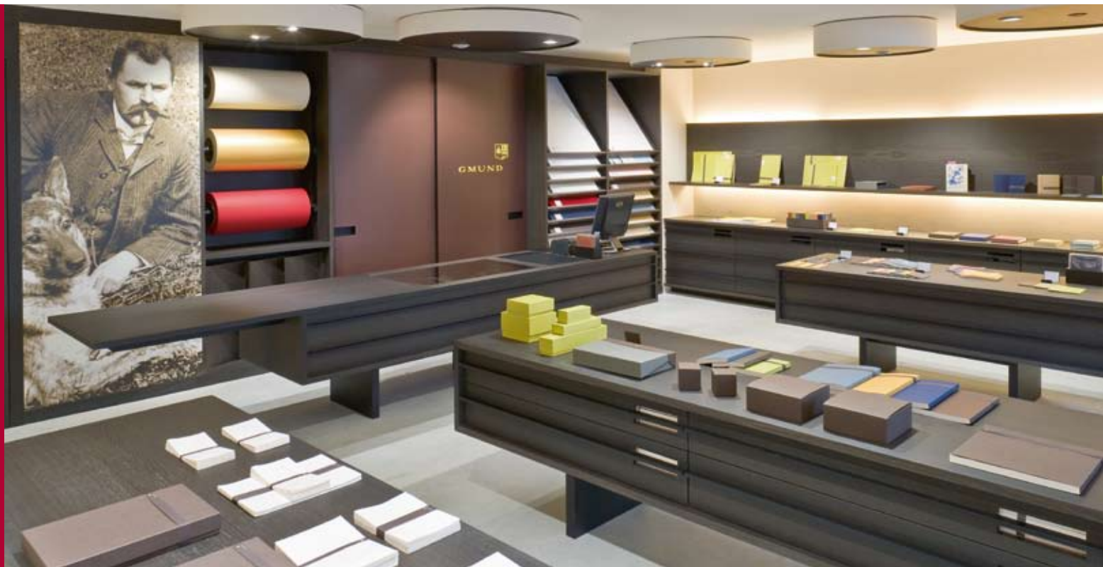
Reflecting the exclusiveness – the interior of the retail store.

Büttenpapierfabrik Gmund opens first store in Munich