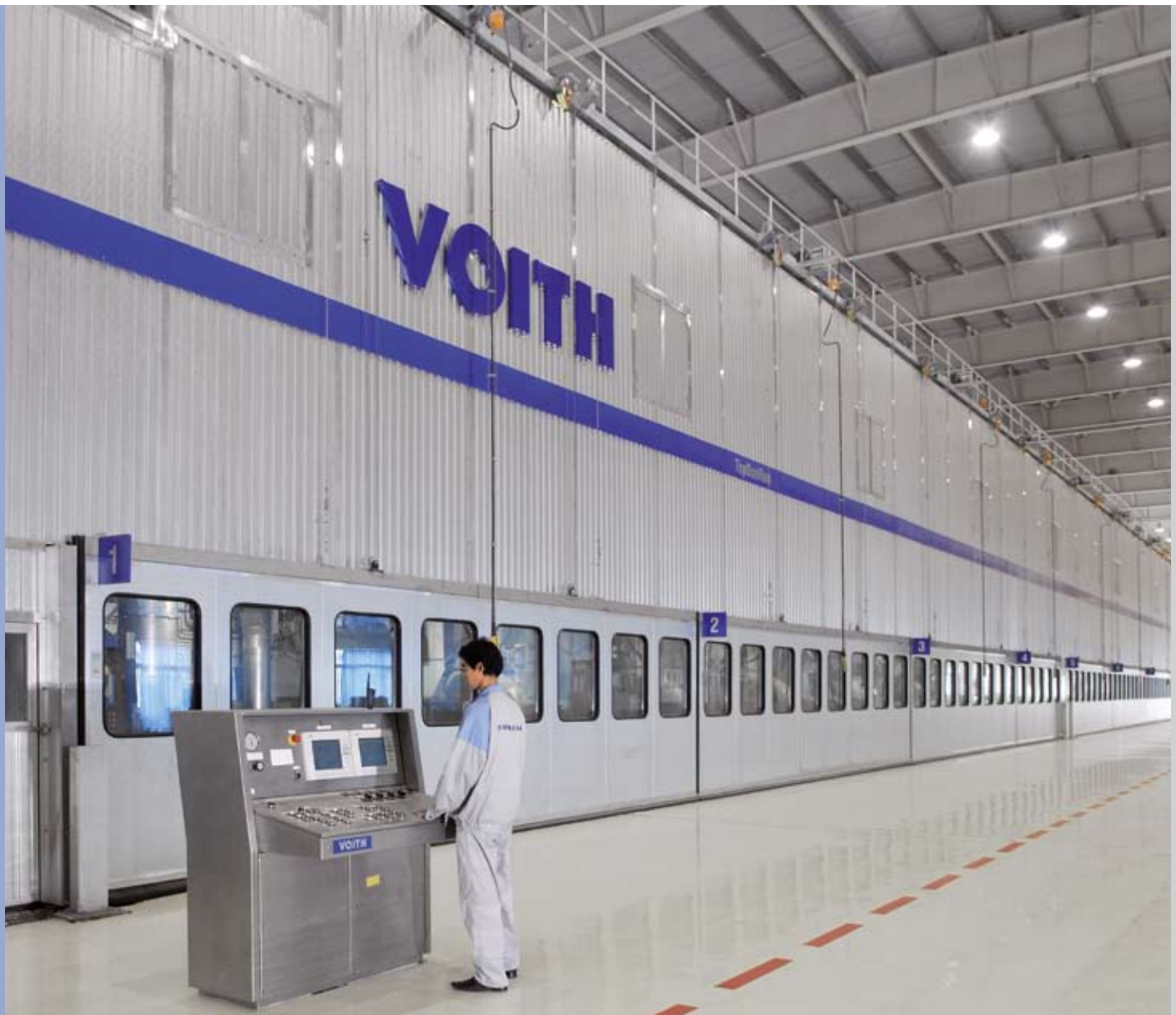
New transfer concept SafeTailing provides for more safety and compressed air savings in the dryer section.

A valuable development of ropeless transfer in the dryer section is SafeTailing. Operation is safer and compressed air can be saved.