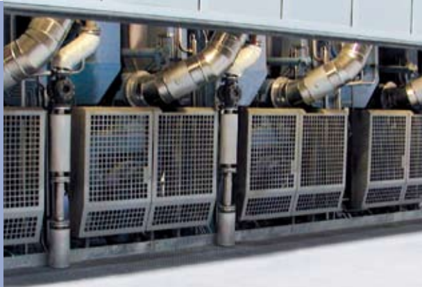
Pilot installation SafeTailing – dryer section with safety barrier.