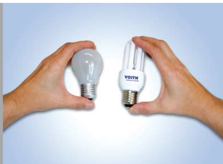
Fig. 3: Amortization period < 1 year for a high degree of customer satisfaction.