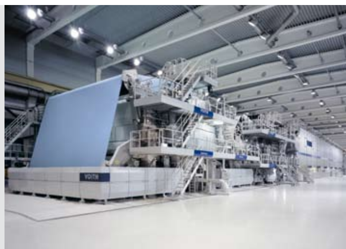
Fig. 1: Process focused on mass consumers.

The Voith process and product engineers are familiar with every step of the papermaking process as well as the latest products and solutions for saving energy effectively. They work closely with the customer to determine the best solutions for the respective situation.