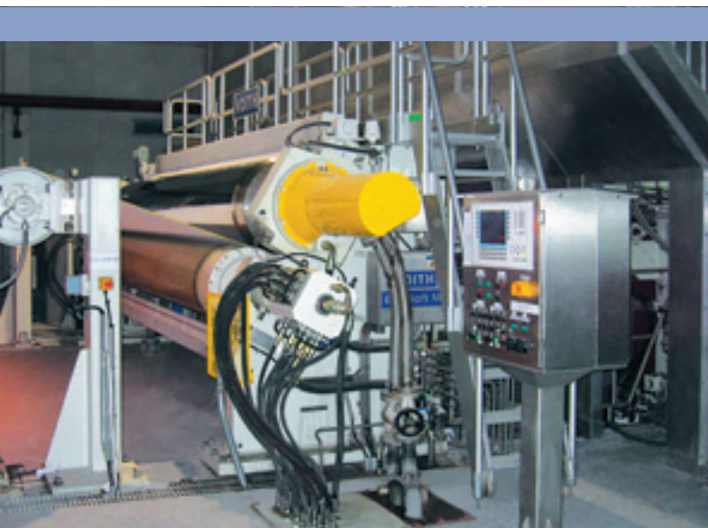
EcoSoft calender installation at Sun Paper, PM 21

The number of orders placed with Voith for calenders of EcoSoft M and EcoCal M providing highest CD profiling resolution by using this Nipcorect M technology proves that the paper industry has fully become aware of the benefits which these machines offer.