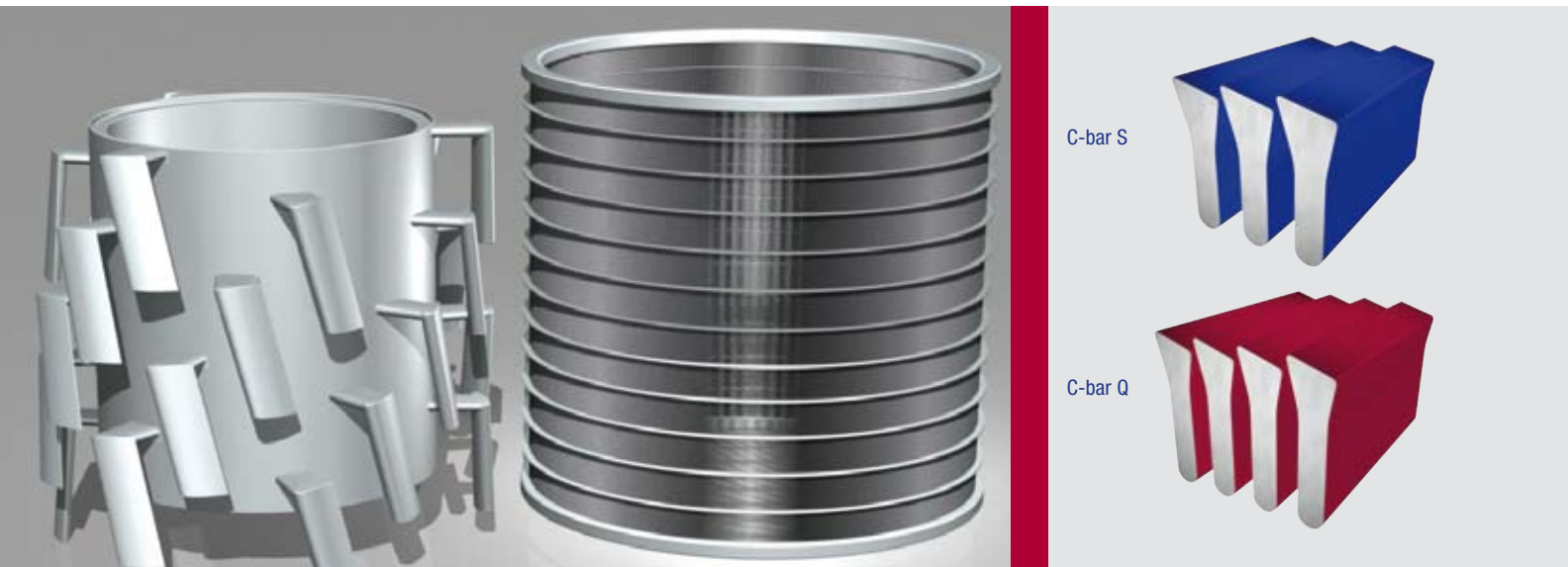
A perfectly matched team: MultiFoil rotor and C-bar screen basket.

Save energy wherever possible: a goal high on the priority list of many paper makers. Utilizing the right combination of rotor and screen basket in the screening machine can save up to 30% on energy costs. The MultiFoil rotor and C-bar screen basket from Voith Paper have proven themselves to be an especially successful duo. Moreover, a newly developed narrow bar basket allows for further improvements in quality.