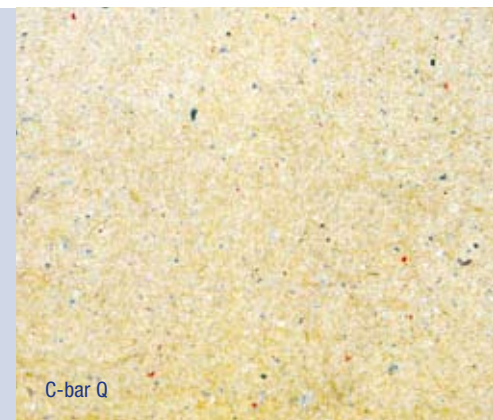
Converted TLA 450 with MultiFoil rotor and C-bar screen basket.