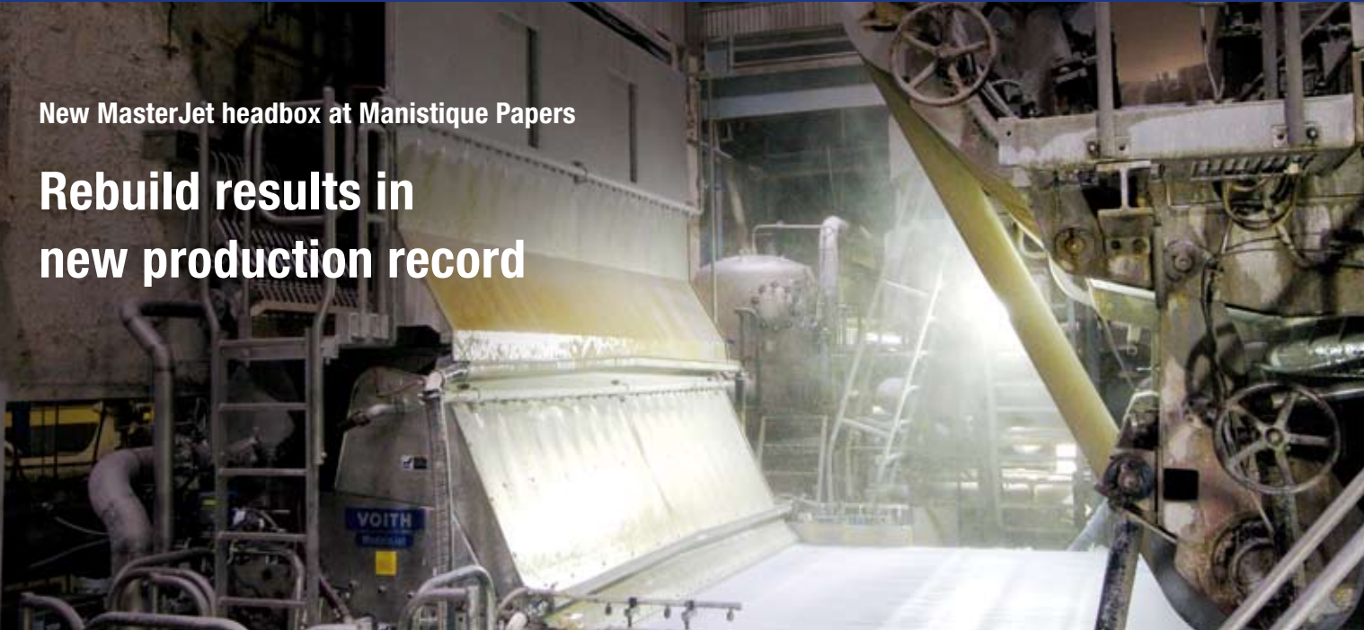
New headbox at Manistique Papers.

In 2007, Manistique Papers invested 6 million US dollars to upgrade their facility by replacing the existing headbox with a new MasterJet II F Dilution Control headbox. Since the start up in June of 2007, the new headbox is fully living up to the customer's expectations and has significantly improved sheet profiles and sheet formation.