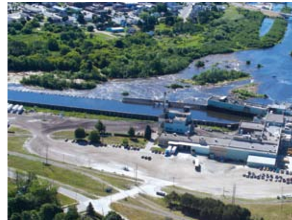
Aerial photo of Manistique Papers.

After a scheduled nine day shutdown, the new headbox was started up on